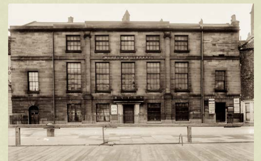
Quayside was built in 1825 as a bath house, museum and library